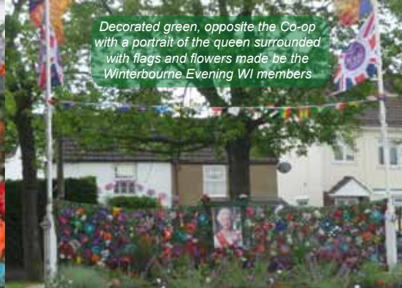
Decorated green, opposite the Co-op with a portrait of the Queen surrounded with flags and flowers made by the Winterbourne Evening WI members