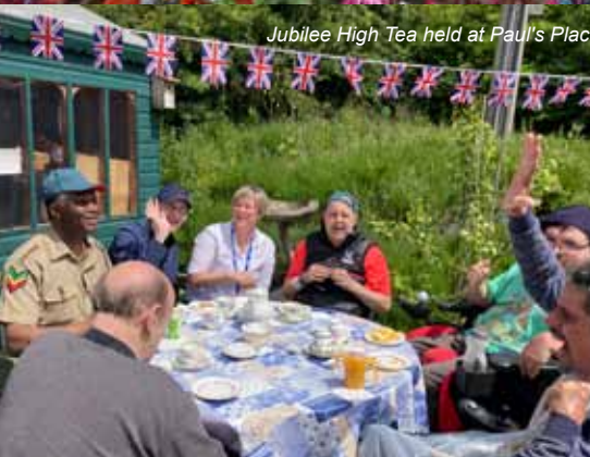
Jubilee High Tea held at Paul's Place for their service users, volunteers and carers