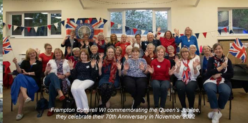
Frampton Cotterell WI commemorating the Queen's Jubilee, they celebrate their 70th Anniversary in November 2022