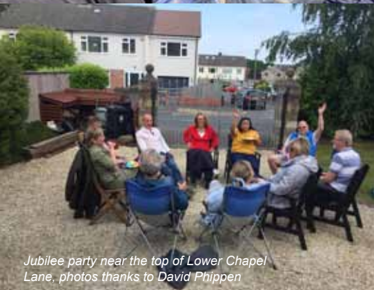
Jubilee party near the top of Lower Chapel Lane

A selection of photos marking the community coming together to celebrate the Queen's Platinum Jubilee. To view images of further local parties and events marking this special event, visit the Facebook page: @FramptonCotterellLocalHistory, who have created a fantastic online time capsule.