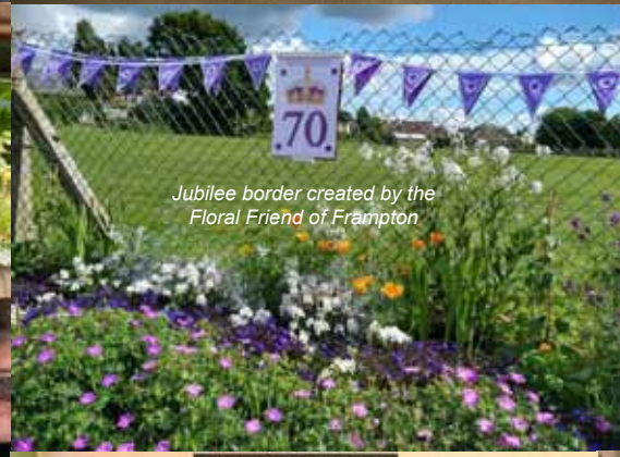
Jubilee border created by the Floral Friend of Frampton