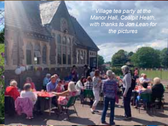
Village tea party at the Manor Hall, Coalpit Heath