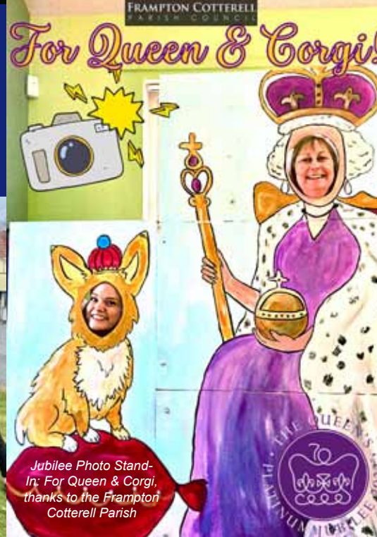
Jubilee Photo Stand-In: For Queen & Corgi, thanks to the Frampton Cotterell Parish