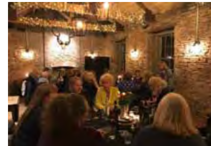
Frampton Cotterell WI members are keeping everything crossed that we can return to scenes like this during the New Year – February 2020 at The White Horse at Hambrook – happy days!

interested in joining us please let us know and get in touch via our Facebook page. Special interest groups that meet separately including a book club, craft group, choir and our skittles and darts teams. Please search FramptonCottWI to find out more, and to like our page.