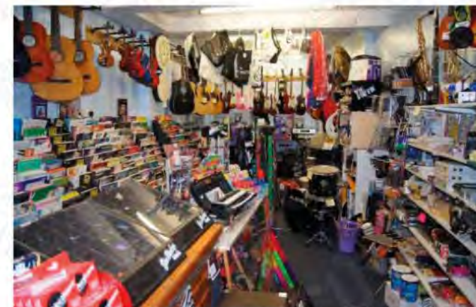
Hannah's Music, an Aladdin's cave for musicians

Please go to our website , www.hannahsmusic.co.uk -if their is anything you need, get in touch, we can send out to you .