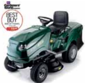
Atco GT 36H Garden Tractor £2,699.00