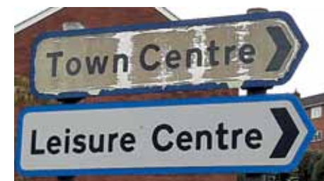
What an improvement! Chepstow Town Centre sign before (above) and after (below)

Chepstow Chamber is an entirely voluntary group, so all the time that goes into working with organisations such as MCC is our own. If you see any faded signs, road markings, unemptied litter bins, etc. you can help with the upkeep of the town by reporting them via the My Monmouthshire app or by visiting www.monmouthshire.gov.uk/my-monmouthshire