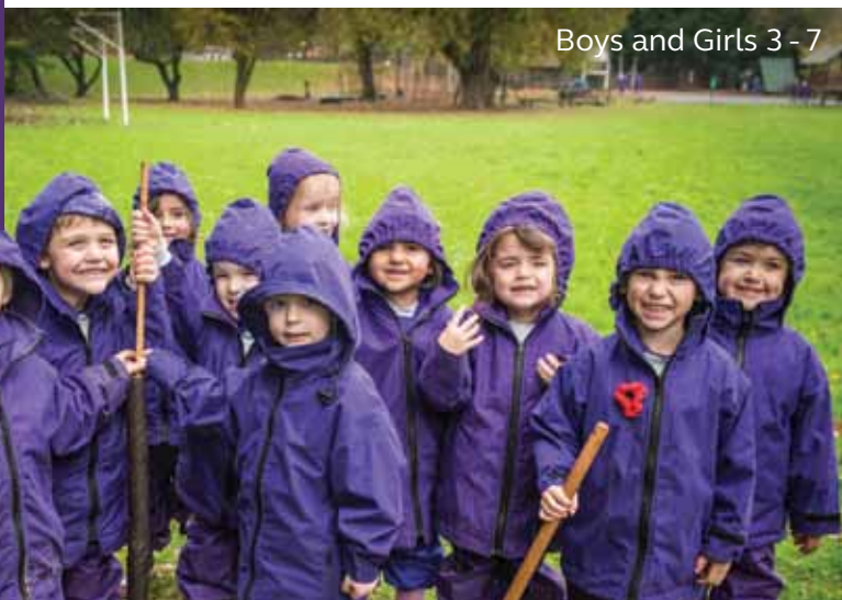
Boys and Girls 3 - 7

Our creative curriculum inspires happy, inquisitive minds.