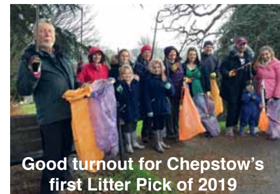
Good turnout for Chepstow's first Litter Pick of 2019