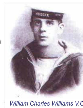
William Charles Williams V.C

On 25th April 1915, during the landing on V Beach Cape Helles, Gallipoli, Able Seaman Williams, with four other men George Leslie Drewry, Wilfred Malleson; George Samson and Sub Lt. Tisdall RN