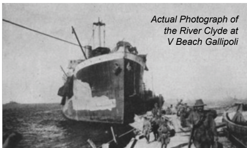
Actual Photograph of the River Clyde at V Beach Gallipoli

to cross, and scores were shot down as they stood helpless on the uncompleted bridge.