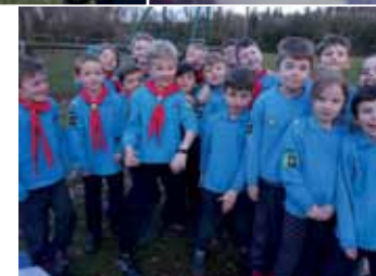
Photos opposite page from the first poppy production; above HRH Prince of Wales and HRH Duchess of Cornwall join in the fun; HRH signed poppy reading for firing; Beavers from 1st Shirenewton. Cubs and Scout from 2nd Caldicot

So as members of the scouting association across Monmouthshire embark on these commemorative events, it is hoped that the sacrifice and human cost of conflict and war is made a present and personal reality, which will remain in the hearts of generations to come.