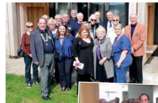
that we're listed as its sponsor on a wall in the entrance to the hospice."