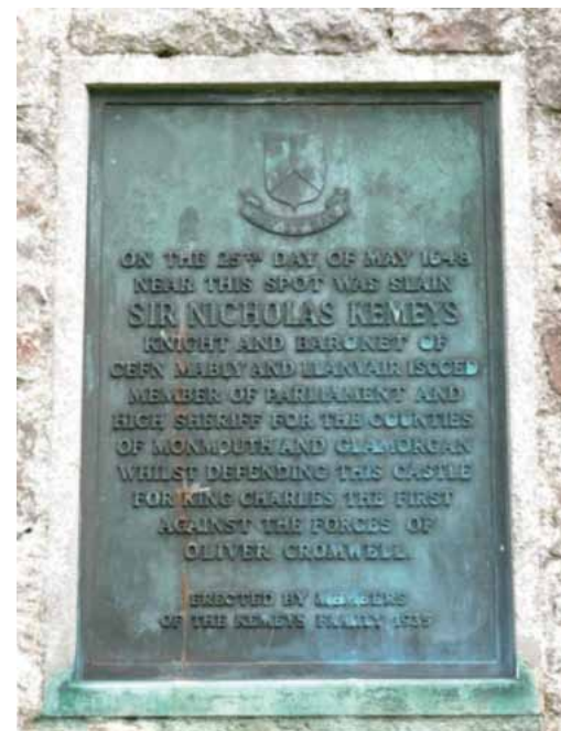
Plaque inside Chepstow Castle