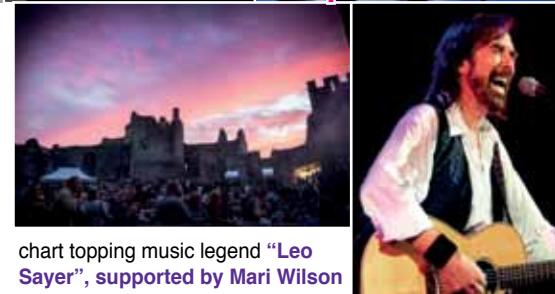
chart topping music legend "Leo Sayer", supported by Mari Wilson & The New Wilsations" - an amazing evening awaits !!!

SUNDAY 26th August- Flying in from Australia is none other than the Grammy award winning, international