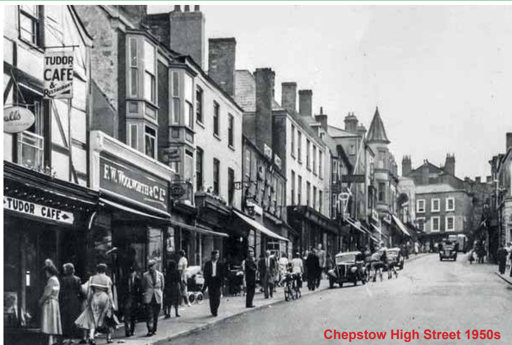
Chepstow High Street 1950s

Hand delivered FREE to c10,000 homes per quarter across Chepstow & the surrounding villages