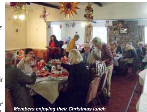
Members enjoying their Christmas lunch.