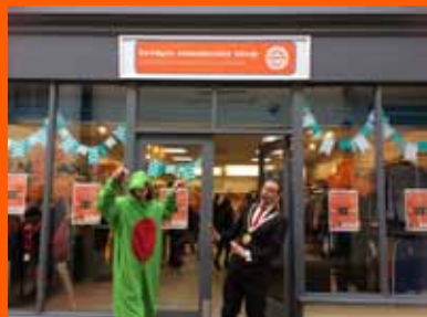
OUR CHEPSTOW COMMUNITY SHOP

Our aim is to support and encourage young people to engage in their local communities; broadening their social networks, making friends, confidence building and learning social skills. We do this through one-to-one and group work encompassing social, leisure and work related activities.