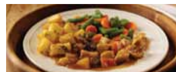
Chicken & Vegetable Casserole £2.99

Lamb Hotpot with Sauté Potatoes, Roast Lamb in Mint Gravy, Chicken & Vegetable Casserole, Roast Chicken Breast with Stuffing, Pork, Leek & Mustard Casserole 2 desserts: Apple Crumble & Custard, Jam Sponge & Custard ORDER CODE: VP8