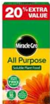
Miracle-Gro All Purpose Soluble Plant Food 1kg + 20% FREE