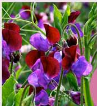
Perennial Sweet Pea