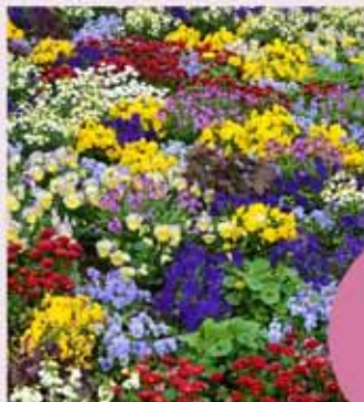
Summer Bedding 6 pack