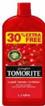
Levington Tomorite 1 Ltr + 30% FREE