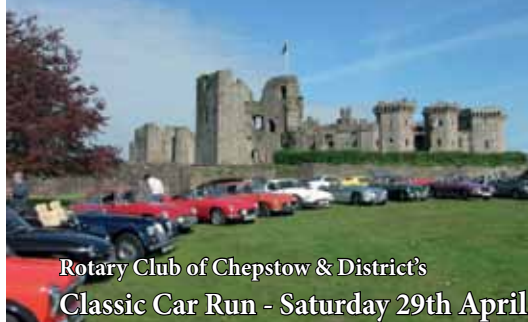
Rotary Club of Chepstow & District's Classic Car Run - Saturday 29th April

Entrants should arrive at Chepstow Garden Centre before 8.30am for a 9am start. Breakfast will be available at the Garden Centre. At the end of the Rally refreshments will be on sale and Rally cars will remain on display up to 5pm, at which time participants will be awarded completion certificates, photographs of their cars and, of course, the prizes.